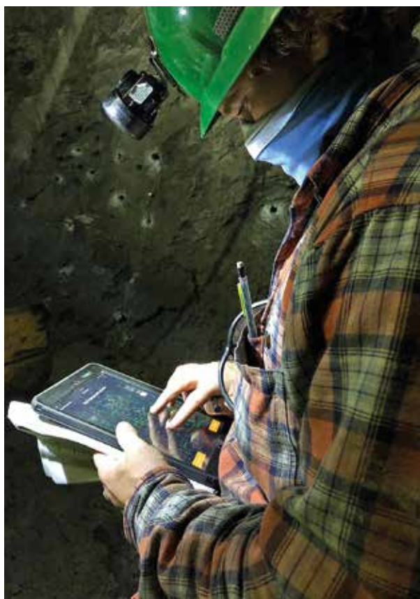
A geologist logging structure in real time via MST Global's FARA GeoApp

"Wireless node-based communications systems are independent from all other systems and power sources"