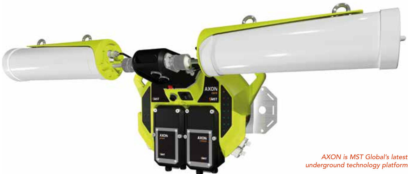
AXON is MST Global's latest underground technology platform

“The definition of mine communications has evolved in the past 10 years”