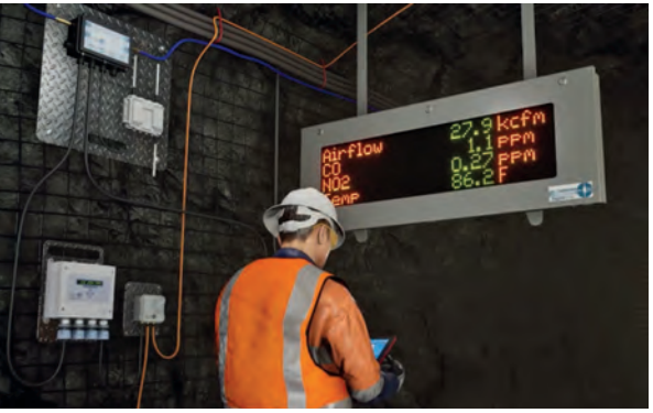
Maestro's Vigilante AQS is in use at operations owned by 17 of the top 20 mining companies in the world

"We have basically rethought how we will configure standard, generic type input/output applications with it."